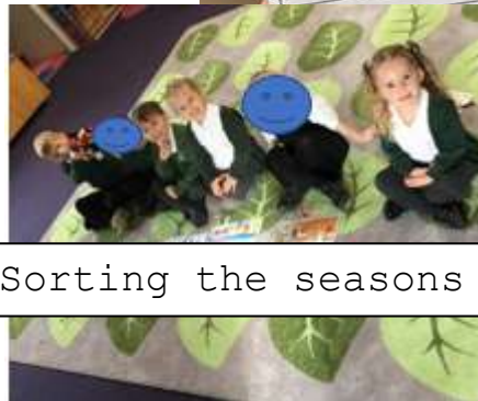
Sorting the seasons