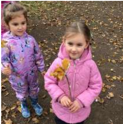
Forest School- looking for signs of Autumn and exploring