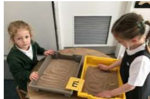
Practising our letters and correct formation.