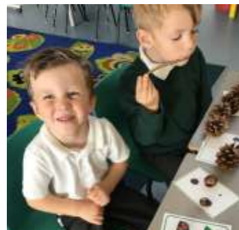
Grouping numbers and objects