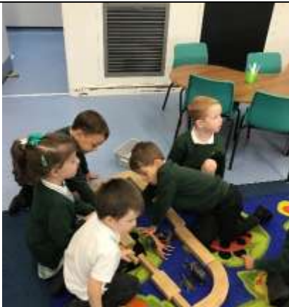
Working as a team and practising our values