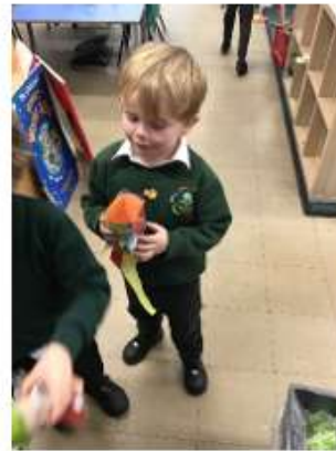
Visit from the police