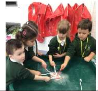
Exploring Oral Hygiene and brushing teeth: