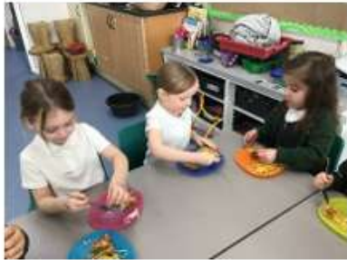
Making a Lunar New Year inspired stir fry: